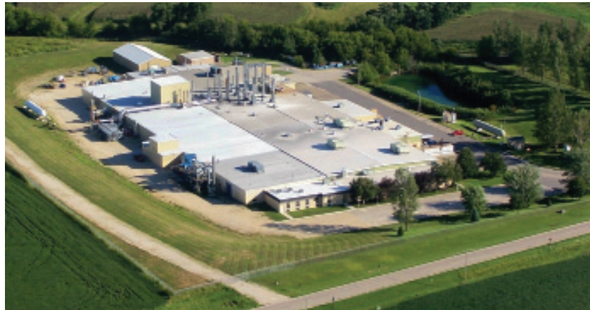
Norplex-Micarta global headquarters in Postville, Iowa, USA

Norplex-Micarta is the leading manufacturer of high performance thermoset composites. Norplex-Micarta's vast product line of tubing, sheet, pre-preg, and rod products serves power generation, military/aerospace, oil & gas, medical device, electrical device, electronics assembly, construction, heavy industry, and transportation industries throughout Asia/Pacific, Europe, and the Americas.