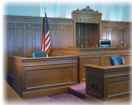
Superior protection for courtrooms, check-cashing, and convenience stores

Overall, ShotBlocker performs similarly to that of conventional S-glass laminates, which cost considerably more.