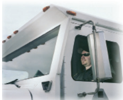
Alternative to steel for armoring trucks, jeeps, and aircraft

Excessive weight is also a problem in airborne applications. The use of steel armor would result in significant reductions in aircraft performance, range, and payload.